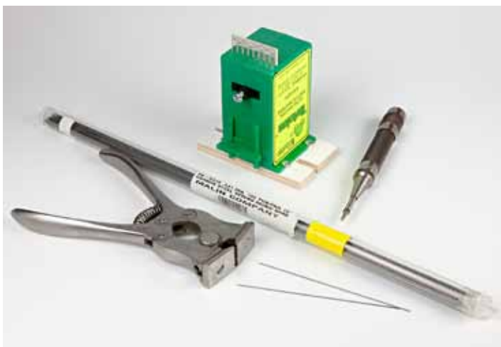
Tortoise, Starrett cutnippers, piano wire, and automatic center punch.

Make a small slotted mounting plate out of 1/4 inch wood floor underlayment plywood. It is easy to accurately drill