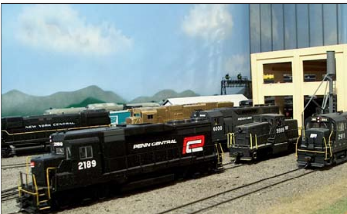
Engine terminal. Dave Zamzow