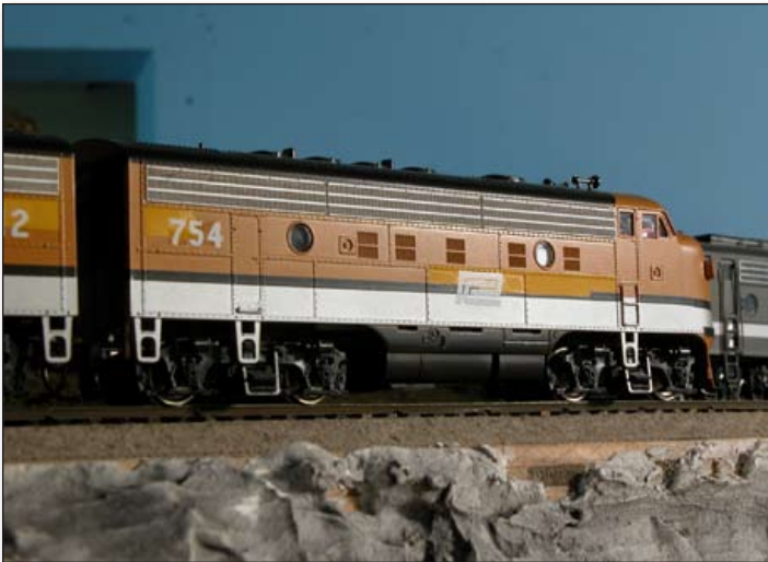
Scrapped by the Grande, these EMD trade-ins were in much better shape than other PC Fs. Bob Sobol