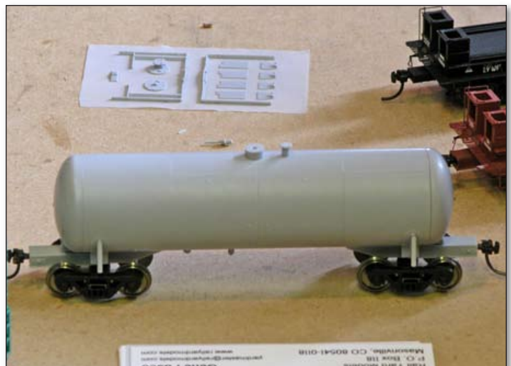
An unreleased product, unique for a urethane kit because the tank cylinder is hollow yet cast in one piece. Bob Sobol