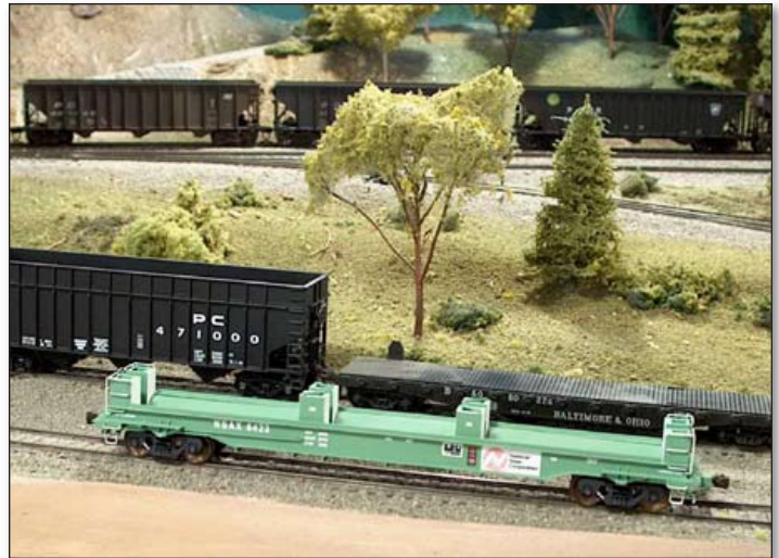
Hot coil car in the wild. Dave Zamzow