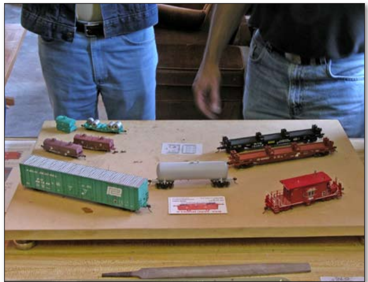
Rail Yard Models rail yard.