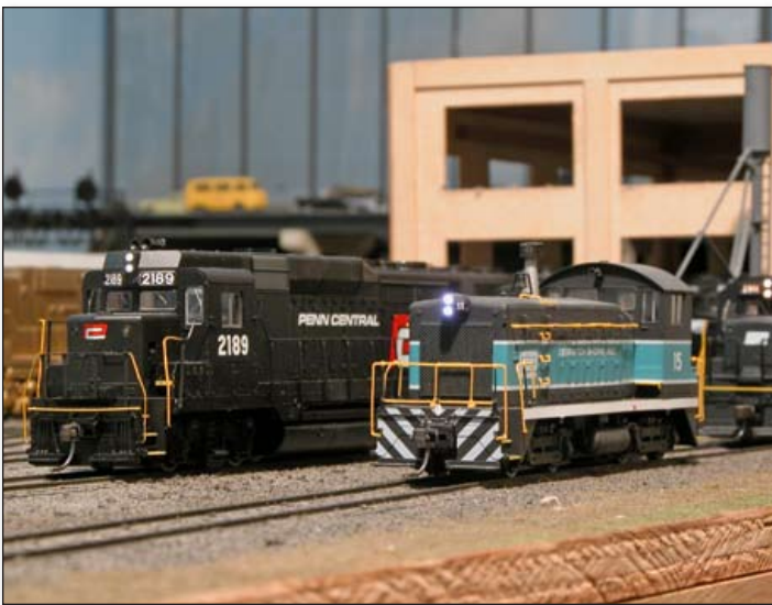
Renegade "NYC" SW paint scheme. Bob Sobol